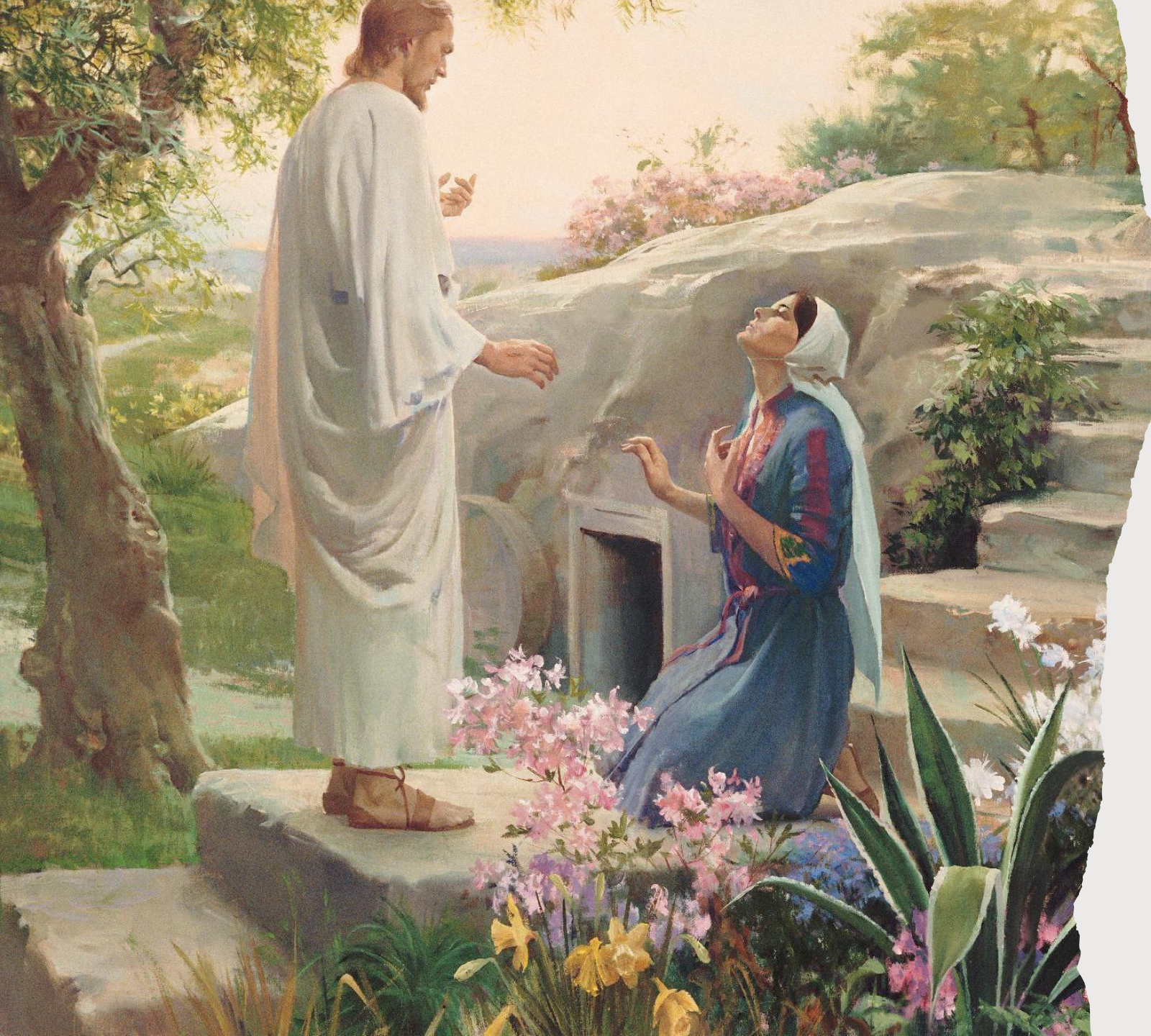
Jesus Appears to his Friends