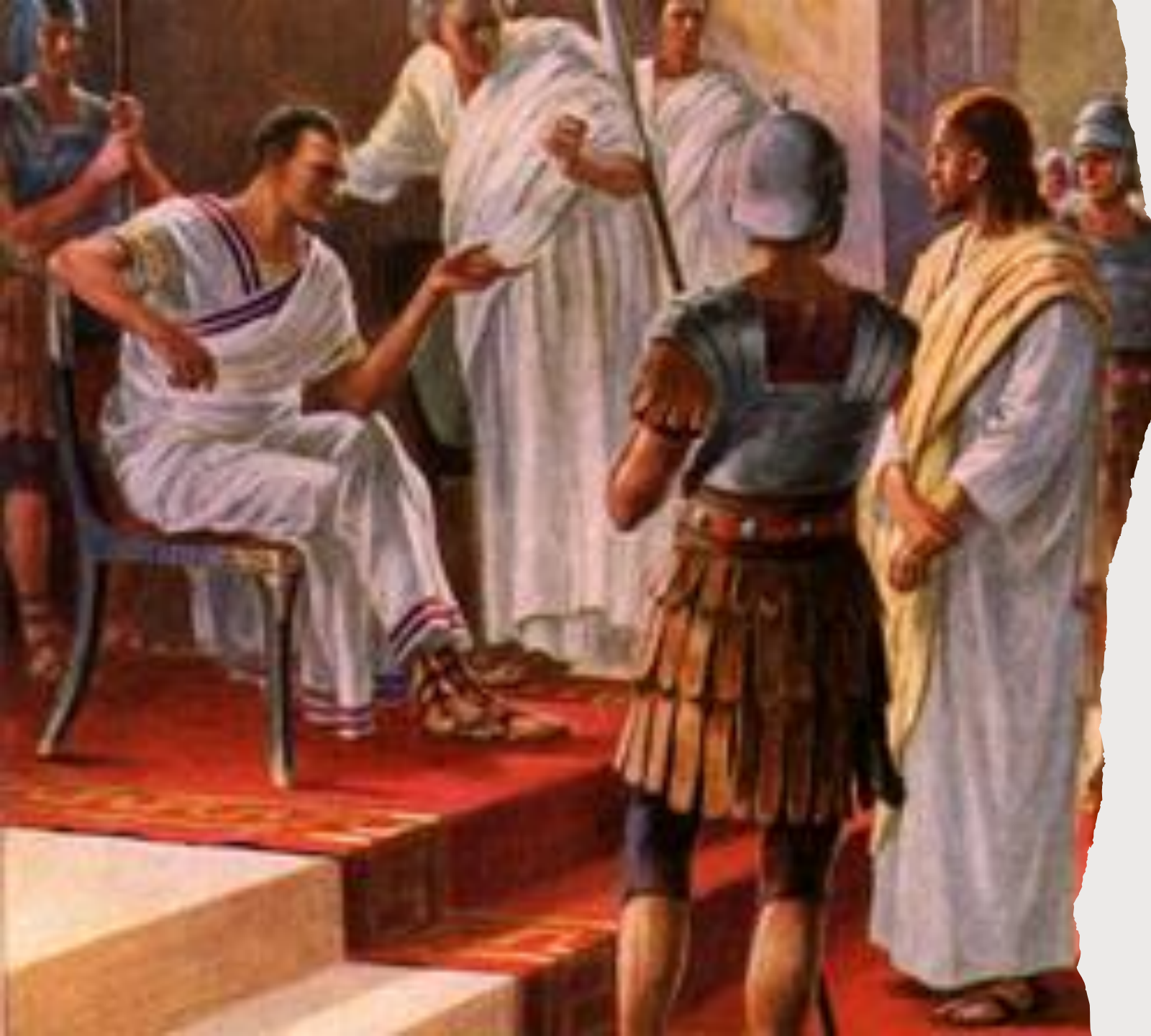
The trial of Jesus