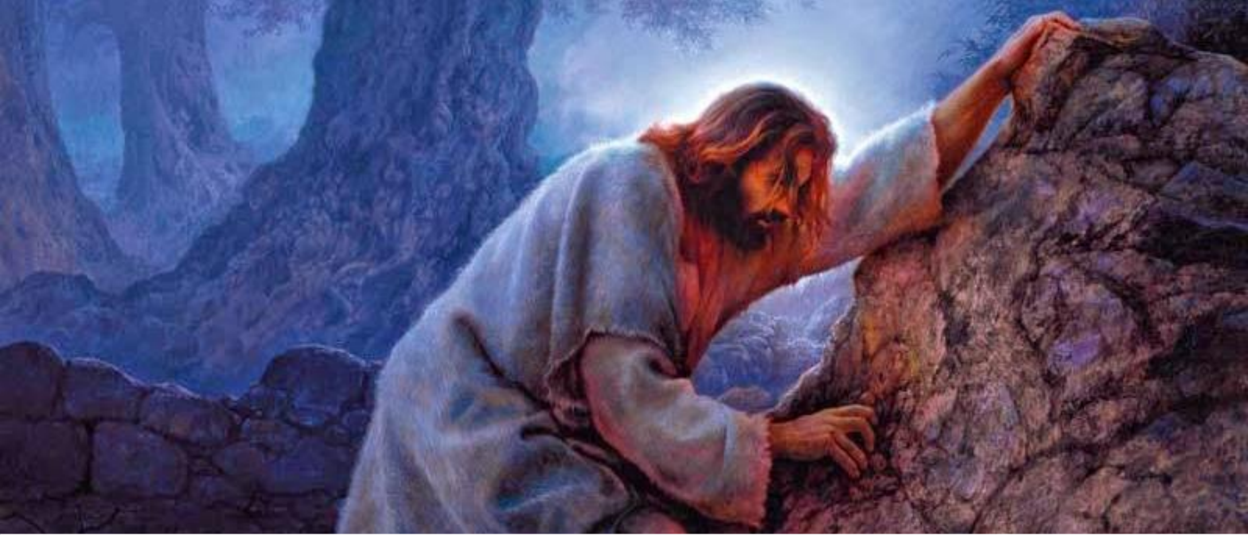
The garden of Gethsemane